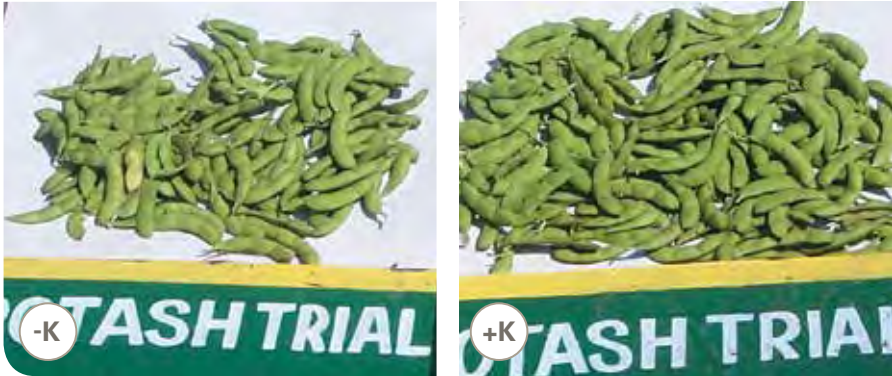
Effect of 25 kg K_2O /ha on the number of soybean pods/3 plants. IPI-NCSR project in the 'soybean belt' of India, Sehore, Mādhyā Pradesh, India. Source: IPI Coordination India. 2002.