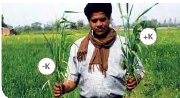
Effect of potassium on wheat. Experiment at farmers' fields. IPI project in Bhondsi, Haryana, India.

Crops need many essential nutrients for optimum growth, yield and quality. Nitrogen (N), phosphorus (P), potassium (K), sulphur and zinc are some of the essential plant nutrients. Crops need N, P and K in large amounts, hence these are applied through fertilizers. Application of plant nutrients in optimum ratio and adequate amounts is called " Balanced Fertilization ".