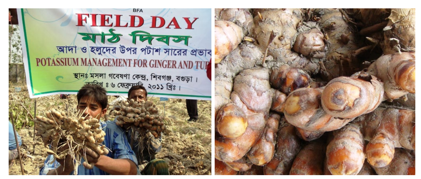
Photos 1. Turmeric rhizome (BARI Holud-3) is a popular spice in Bangladesh.

It was commonly believed that adequate amounts of K were present in Bangladeshi soil to meet crop demand. While this might have been true for local crop varieties with low yield potentials, major crop intensification that has occurred in recent years has placed a higher demand on K supply, rendering crops more susceptible to K deficiency. Despite the growing consciousness of farmers of the beneficial effect of applying K together with N and P, there is widespread K deficiency which has been reported on a variety of crops. These include potato, sweet potato and other root crops, sugarcane, fruit, onion, garlic, fiber crops and high-yielding variety (HYV) cereals (Islam et al., 1985; Kundu et al., 1998; Noor et al., 1993; Miah et al., 2008). In terms of unit nutrient requirement, K is almost equal to that of N (Sadanandan et. al., 1998). In most plant species the K requirement in leaves, fruits and tubers is about 20-50 kg-1g. Potassium, although not itself a constituent of any metabolite, plays a key role in functions of plant