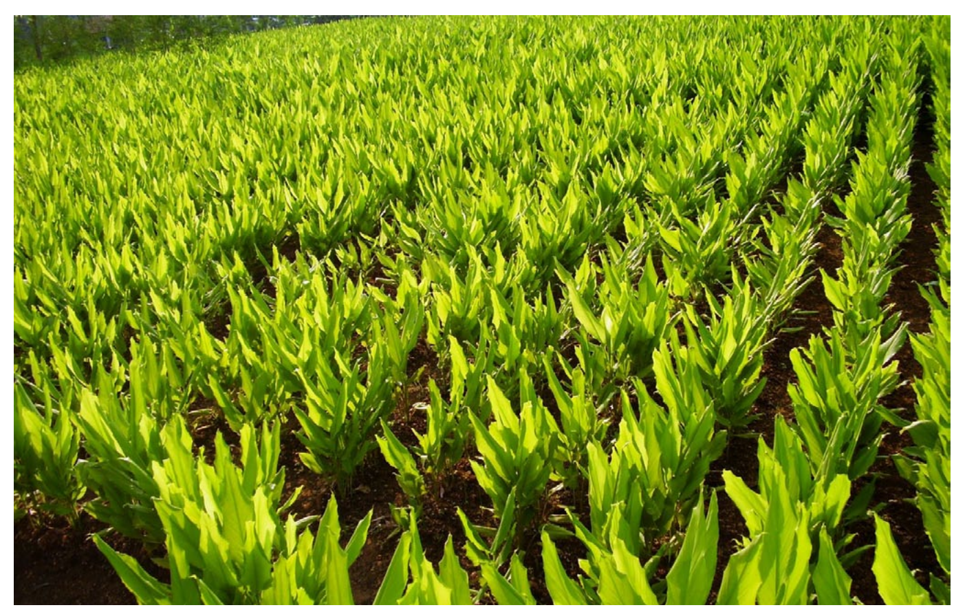
Turmeric field in Tamil Nadu, India.