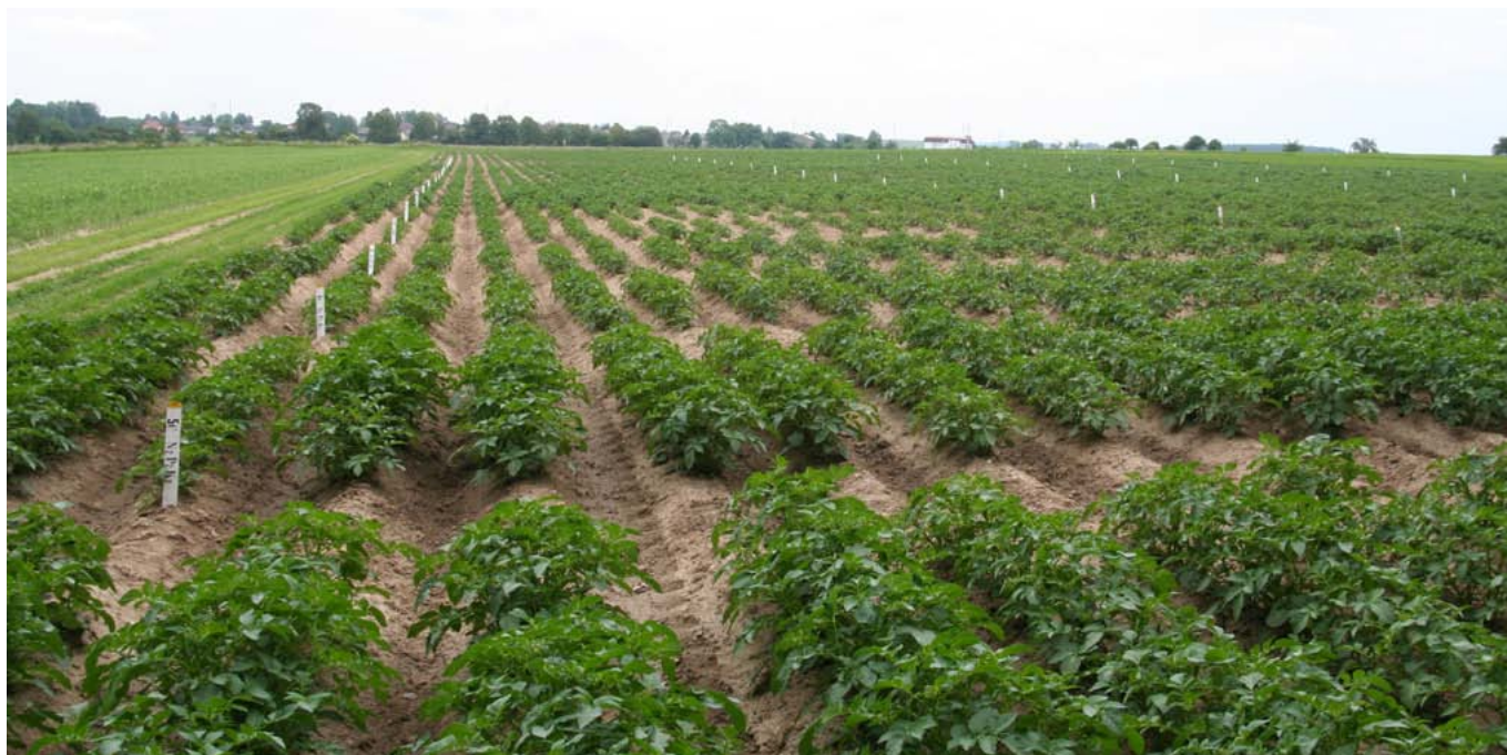
Field experiment in potato crop, Lípa.