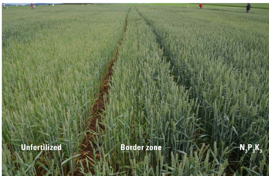
Field experiment in winter wheat crop, Jaromerice. On the left, unfertilized plot, and on the right, a N_3P_3K_3 combination, separated by a border belt (center).

second potassium level (K2) showed a positive K balance at harvest of the main product only. On the other hand, at this level (K2) a negative balance resulted for harvest of total production. A similar situation also occurs at the first level of potassium fertilization (K1). In the PGA the positive effect of by-product on balance was evident.