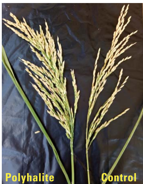
Fig. 2. Better grains filling and stronger panicle in polyhalite treated panicle compared to the control.

Average rice yields of the Karawang area are 7.0-8.0 t ha -1 , so the yield results of both treatments are representative of the area. However, the polyhalite-treated paddy had bigger and stronger panicles compared to the control (Fig. 2). The grains were also rounder with a more uniform shape and better filling. Based on three samples containing 100 grains, the average weight of the grains was 9% higher in the plot treated with polyhalite (Fig. 3). In regards to the plant height, the polyhalite-treated rice was, on average, 8-10 cm higher than the control and appeared less affected by diseases (Photo 1, p. 15).