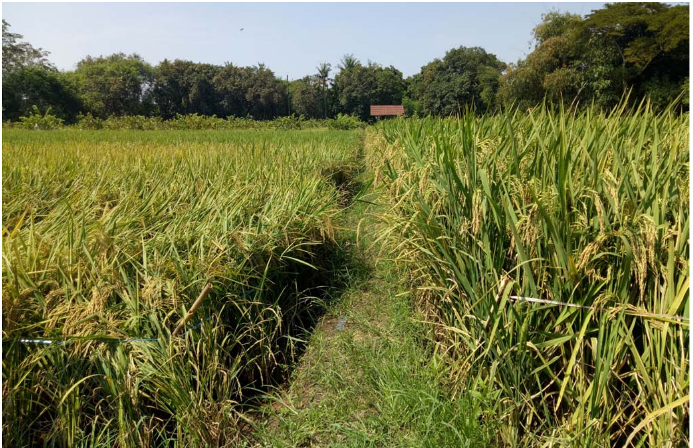
Photo 1. Control plot on the left and polyhalite-treated plot on the right, showing the plant height difference; Karawang, Indonesia.