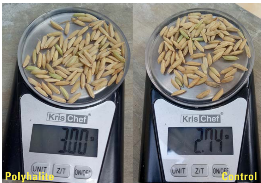
Fig. 3. Weight of 100 grains in control and polyhalite treated rice. Note 9% higher grain weight in the polyhalite treated rice compared to the control.