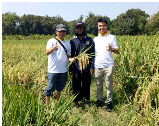
Photo 2. Paddy producer (center) with the distributor (right) and an agronomist (left).