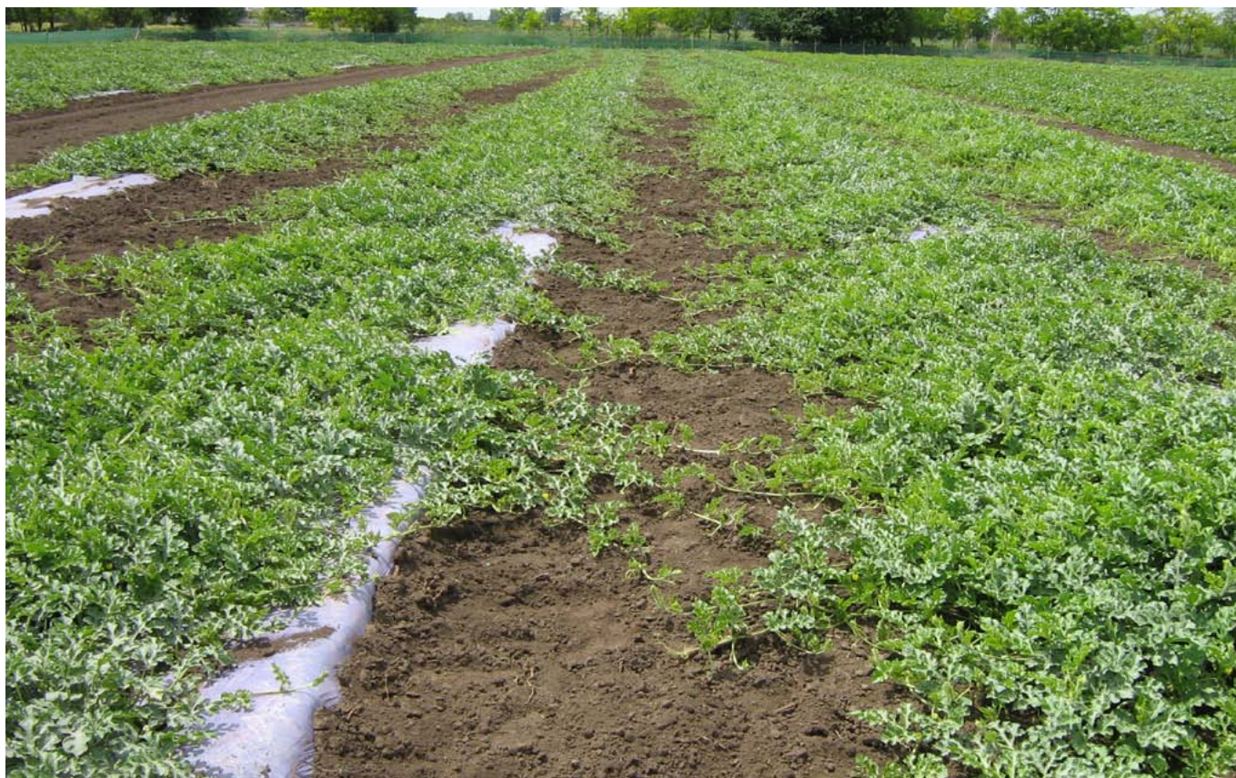
Photo 1. View of the experimental field.