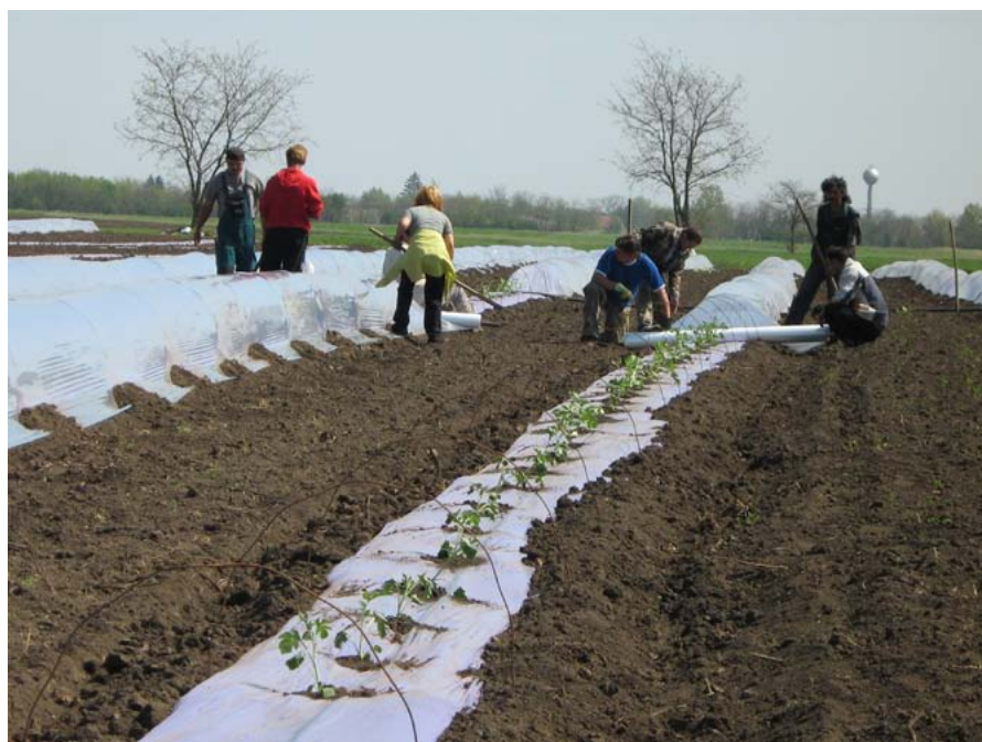
Photo 2. Layout of the experiment (30-05-2009).

The experiment was conducted on a grower’s farm using intensive technology (drip irrigation, plastic soil cover, low plastic tunnel covering). Seedlings were used as propagating material each year. In 2009, the grafting was performed using the one-cotyledon grafting technique. In preparing a field, the land was disked, and rows laid out by the farmer. Beds were then fully shaped, treated for weeds and soil-borne pests, drip irrigation lines run, and plastic placed on top with the edges buried under the soil to hold it in place. Color plastic mulch was laid over each raised bed. Each