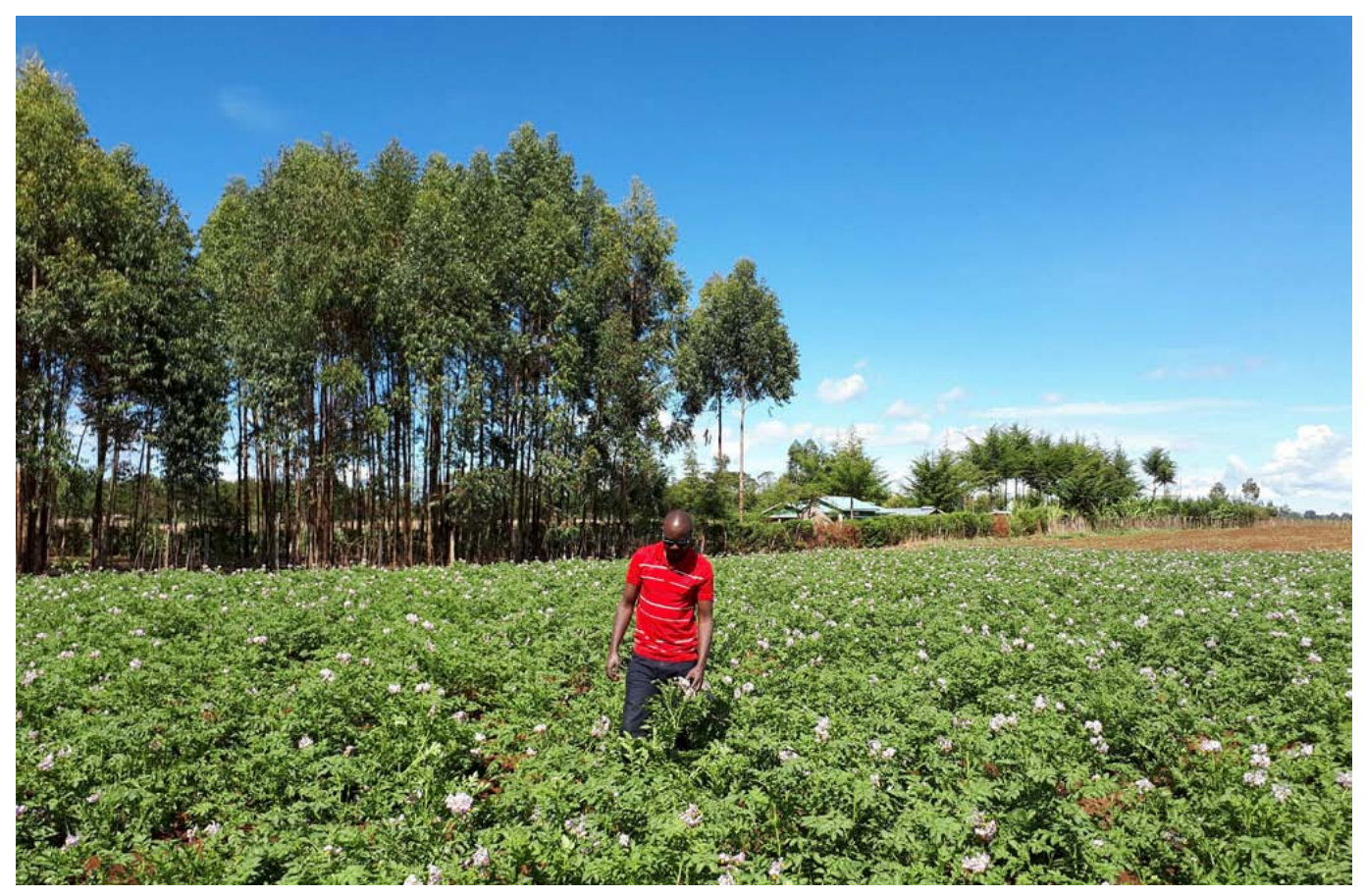
Inspection of one of the Mavuno Zaidi demonstration plots.