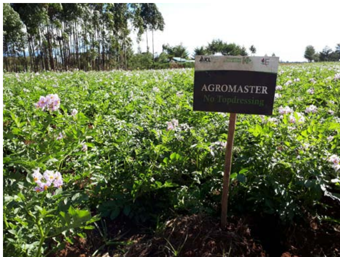
Photos 2. Potato demonstration plot.

The paper "Mavuno Zaidi - Large-Scale Farmer Outreach has Increased Potato Yields in Kenya through a Focus on Balanced Fertilization" also appears on the IPI website at: