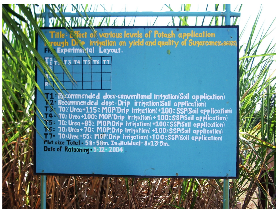
Experimental plot at the Vasantdada Sugar Institute fields.

Sugarcane is a long duration crop which produces huge amounts of biomass, requiring large quantities of water,