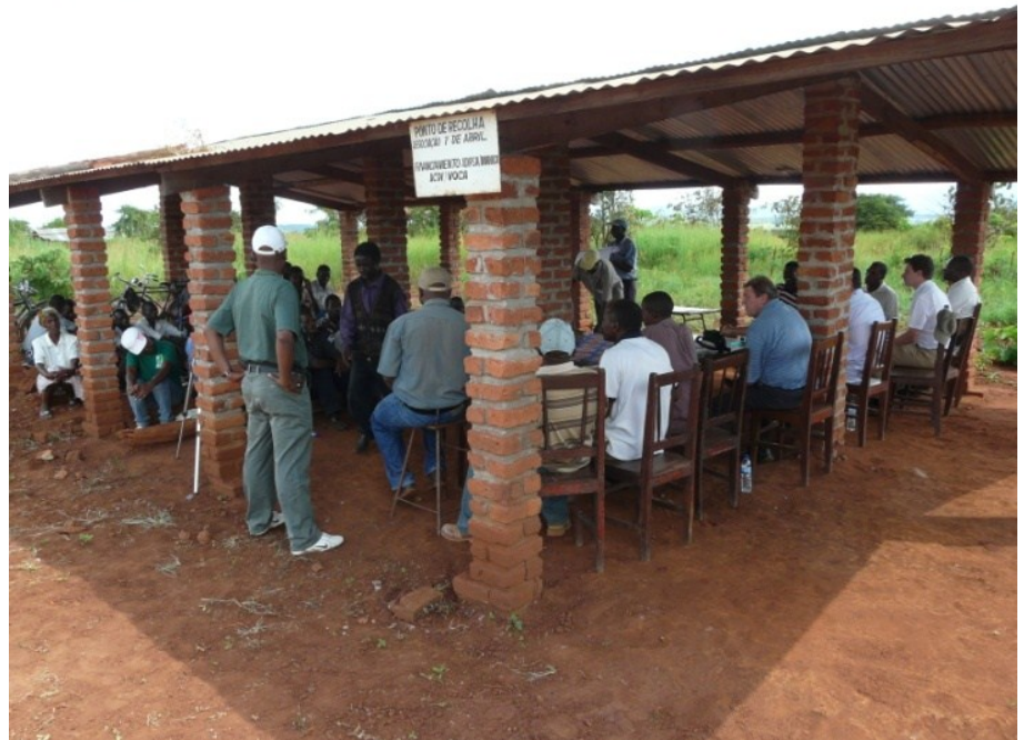
Farmers association meeting.

The other focus of the MIM project is the transition from subsistence farming to commercial maize production and