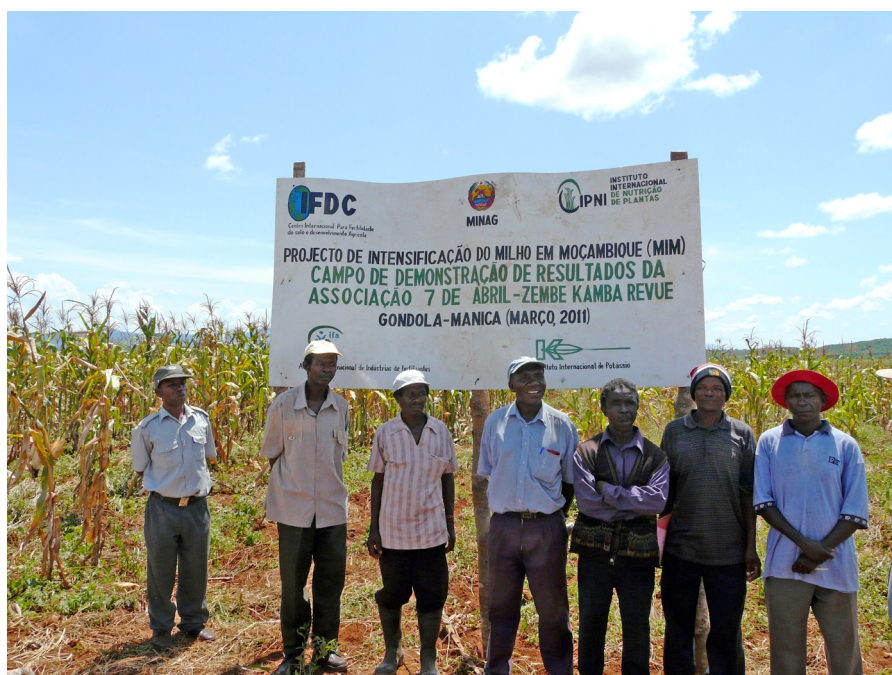
Farmers from the association "7 de Abril - Zembe" in front of their demonstration field.

Potash Institute (IPI). The project was initiated in response to the Abuja Declaration on Fertilizer for an African Green Revolution that commits governments in SSA to increase fertilizer use to an average of 50 kg ha -1 .