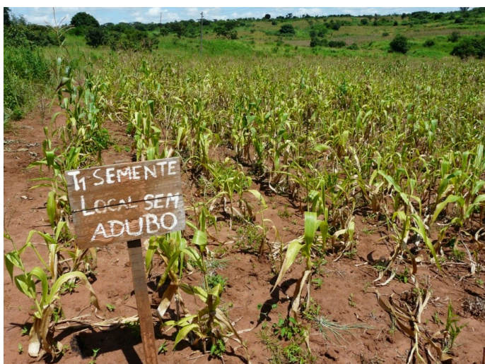
T 1 plot: Farmer-saved seeds without fertilizer.