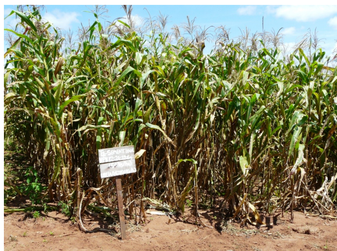
T 6 plot: Hybrid variety + 100 kg ha -1 fertilizer.

more productive improved maize varieties, it is estimated that at least 95 percent of maize planted in Mozambique is farmer-saved seed. It is reported that less than one percent of maize planted is with hybrid seed and approximately four percent is with certified/commercial seed of open-pollinated varieties (OPVs).