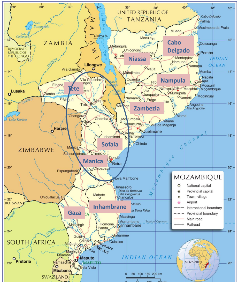
Map of Mozambique with a focus on the Beira corridor, central Mozambique (marked by the circle).